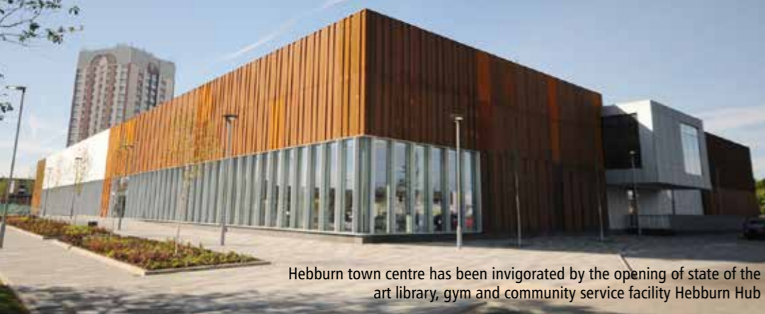
Hebburn town centre has been invigorated by the opening of state of the art library, gym and community service facility Hebburn Hub