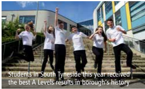
Students in South Tyneside this year received the best A Levels results in borough's history