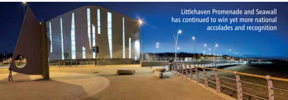
Littlehaven Promenade and Seawall has continued to win yet more national accolades and recognition