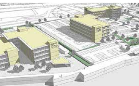
Holborn Riverside and the IAMP both secured special Enterprise Zone status