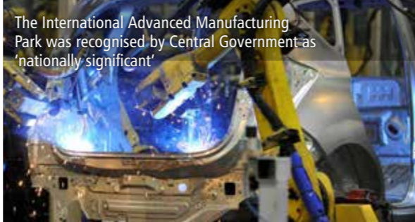
The International Advanced Manufacturing Park was recognised by Central Government as 'nationally significant'