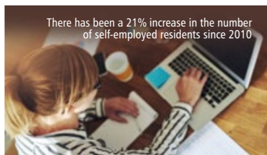
There has been a 21% increase in the number of self-employed residents since 2010

3895 new businesses have started up in South Tyneside since 2010