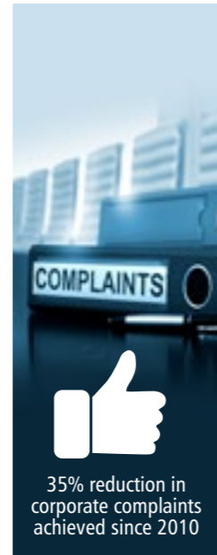
35% reduction in corporate complaints achieved since 2010