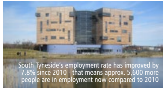
South Tyneside's employment rate has improved by 7.8% since 2010 - that means approx. 5,600 more people are in employment now compared to 2010