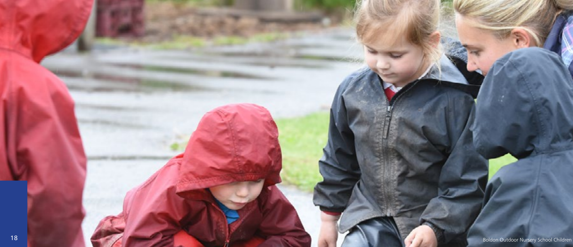
Boldon Outdoor Nursery School Children