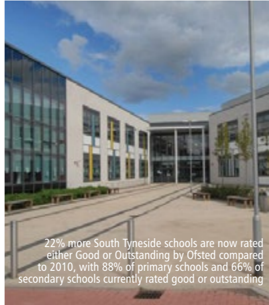
22% more South Tyneside schools are now rated either Good or Outstanding by Ofsted compared to 2010, with 88% of primary schools and 66% of secondary schools currently rated good or outstanding