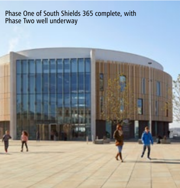
Phase One of South Shields 365 complete, with Phase Two well underway