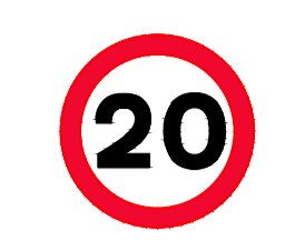
Ref 3 TSRGD 670 300mm dia