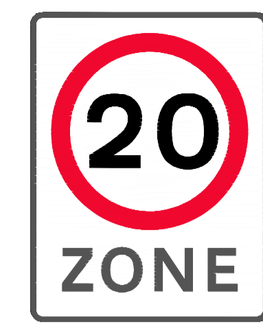
Ref 1 TSRGD 674