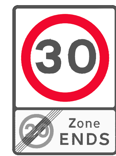
Ref 2 TSRGD 675