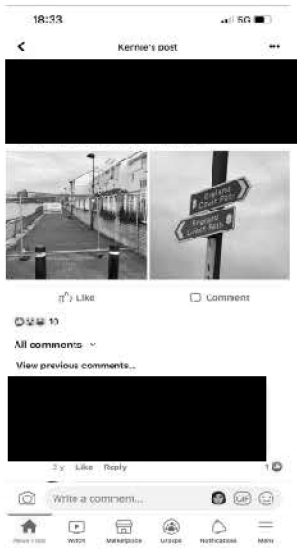
Sign Position 1