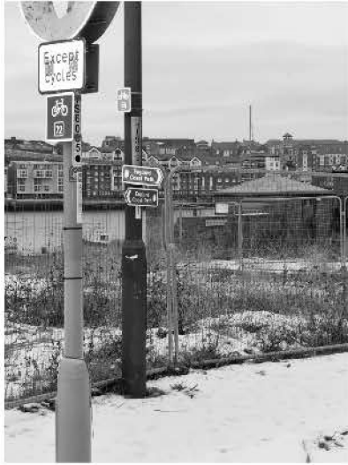
Sign Position 2