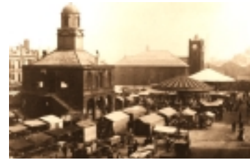
MARKET PLACE c1898-1900

The walk starts and finishes at South Shields Metro Station. Proceed along King Street, passing under the Metro Bridge heading towards the Old Town Hall and Market Place .