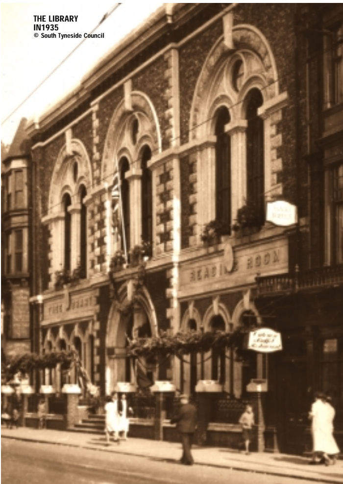
THE LIBRARY IN 1935

Continue along the pedestrianised area back to South Shields Metro Station.