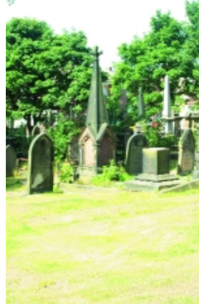
WESTOE CEMETERY

The cycle path follows the route of the old Westoe Mineral Line , which would once have carried coals from Westoe Colliery to the river. Westoe Colliery was the last mine to close in South Tyneside in 1993. Look out for the woodcarvings by chainsaw artist Rodney Holland depicting the coalmining heritage of this area. The sculptures were carved into diseased trees, which had to be felled for safety reasons. New trees have been planted to replace them.