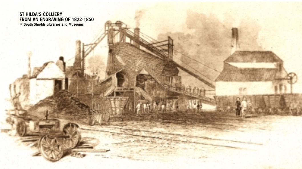
ST HILDA'S COLLIERY FROM AN ENGRAVING OF 1822-1850