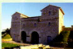
Arbeia Roman Fort