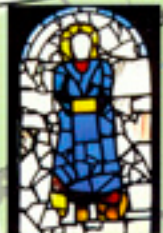
Stained glass, Bede's World