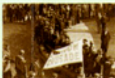
The Jarrow March