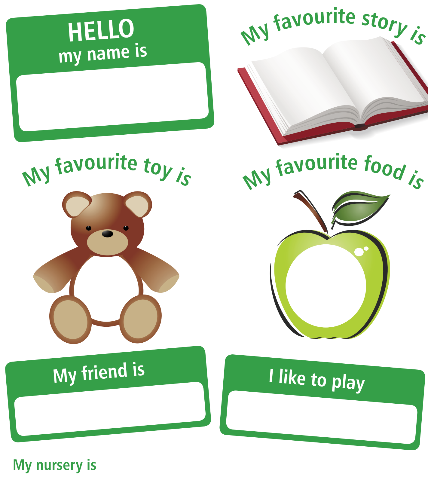
Part 2 To be completed with the child